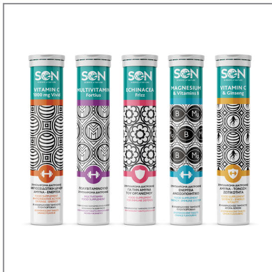
MAIN PORTFOLIO www.ctplusdesign.gr