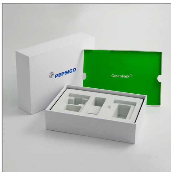
CARDBOARD ENGINEERING www.ctplusdesign.com/engineering